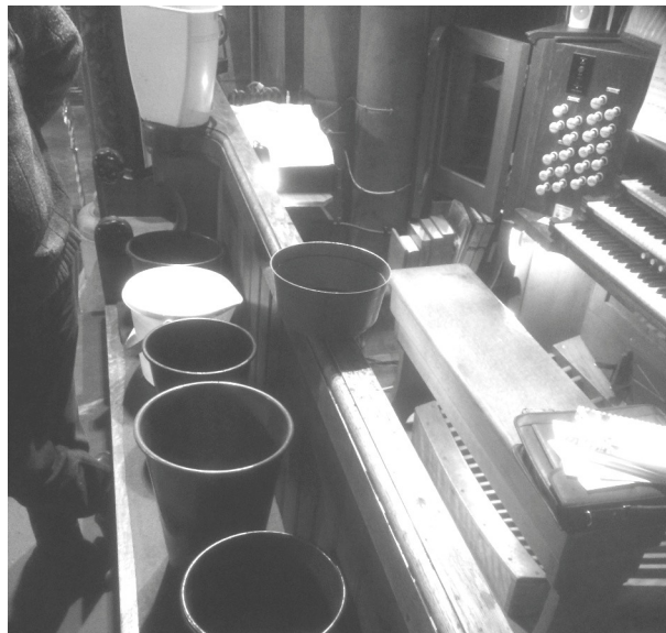
ABOVE: Buckets ready in St Paul's. Storm Doris wasn't helpful to two of our churches, even though the insurers refer to her as "an act of God!" Church roofs suffered damage at St Paul's and St David's (report from St David's below)

A few days later, Storm Doris paid a visit to St David's,