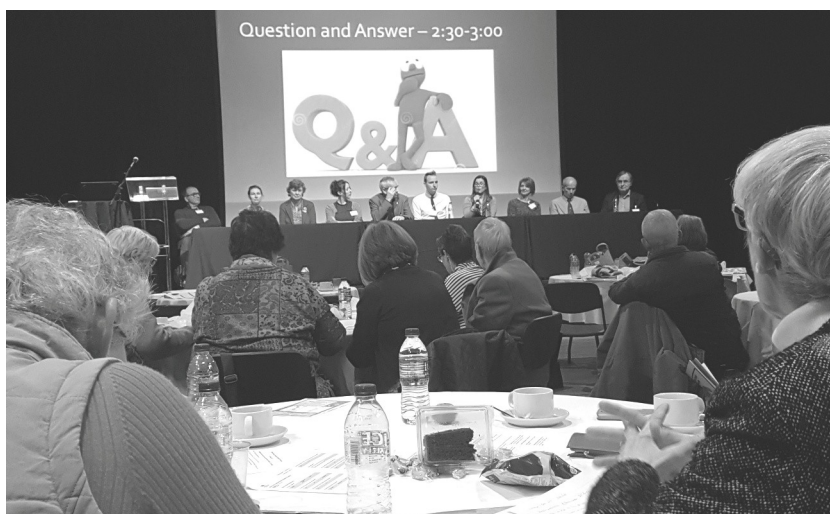
ABOVE: Dementia has been a topic of consideration in many of our churches recently. In March, St David's Church congregation heard what they can do to be dementia friendly. Representatives of the mission area also attended this conference in Llangollen to find out more.

damaging the roof of the church. We began to worry. How much damage? Who can do emergency repairs? Are the neighbours (who concerned about bits flying off? The weather forecast was continuing blustery high winds. The rain got in, but not too much as most of the rain was in the insulation in the ceiling. Bits did fall off but on to the car park below. By Monday afternoon the roof had been stabilised and made waterproof. And we all, as by now the whole congregation was involved, didn't need to worry quite so much anymore.