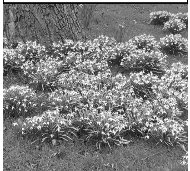
BELOW: This is the first chance we have had to mention the wonderful snowdrops that are the first sign of spring at St Michael's