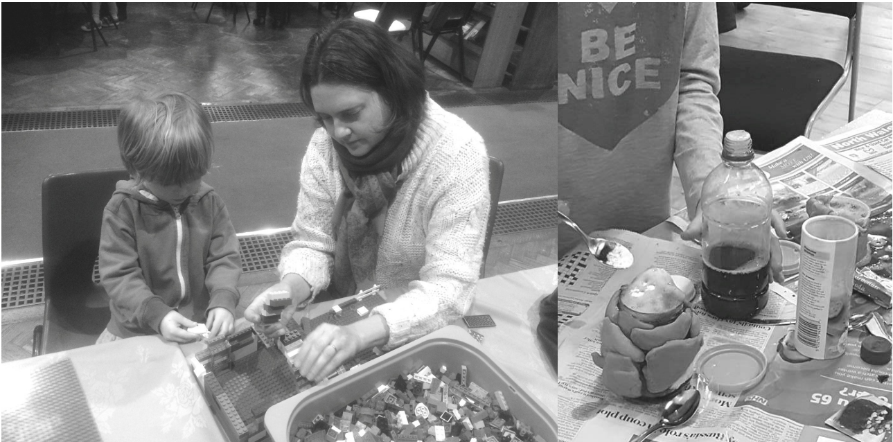
Children's activities in our churches. LEFT: building a house out of Lego at St Paul's in Craig y Don - the house will form part of a video of the parable of the wise man who built his house on the rock. RIGHT: Messy Church at St Ffraid's in Glan Conwy - making a volcano out of Play-Doh to show how our emotions sometimes boil over!