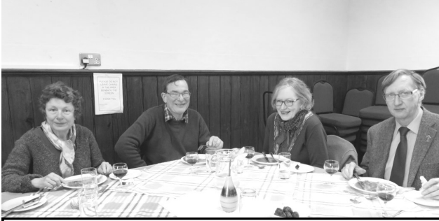
ABOVE: Your production editor (second from right) doesn't normally feature in photographs in Church News, but has managed two appearances in this issue - see if you can find the other one! The menu at the St David's Day lunch in Llanrhos included hotpot, followed by trifle or apple pie.